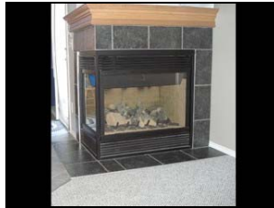
2 Sided Gas Fireplace