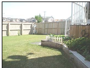
View of Backyard