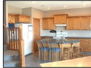
Maple Island Kitchen