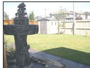
View of Backyard